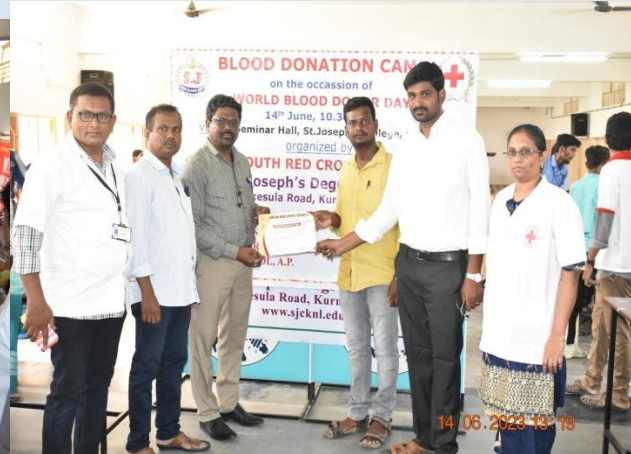
BLOOD DONATION CAMPAIGN